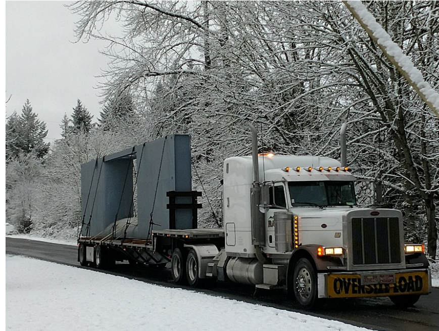
New fish weir