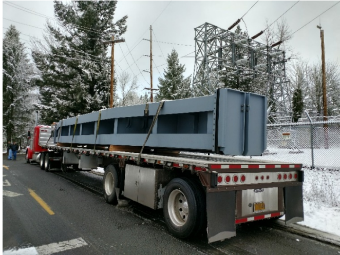
New stoplogs for the weir