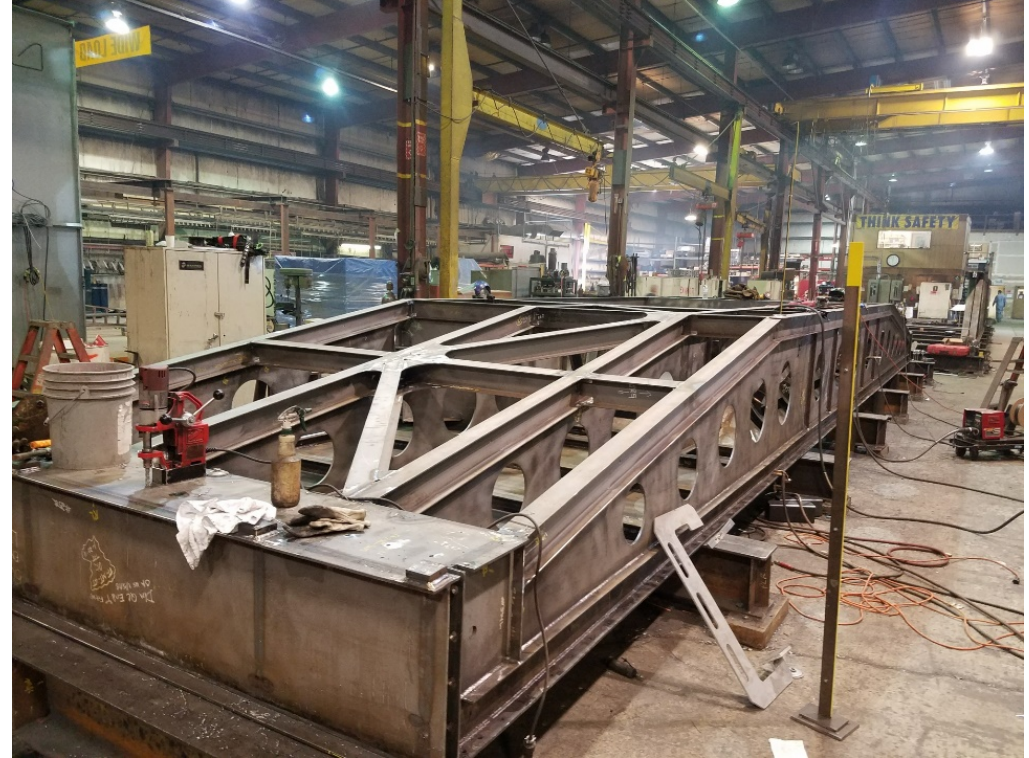
New weir under construction